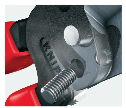
Non-threading screw cutting can be used from either the front or the back