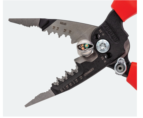
Shear type blades easily cut BX/MC cable