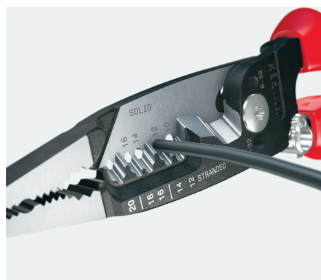
Locating ridges make it easy to find stripping holes