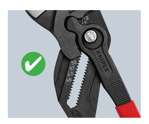
> Updated Pliers Wrenches have an adjustment scale; if the tool does not have the scale, these jaw protectors will not work