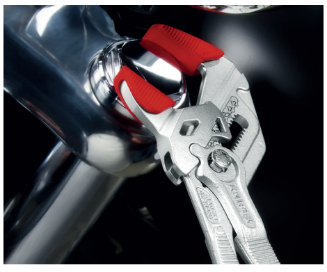
> Non-marring – offers an extra layer of protection for the pliers wrench