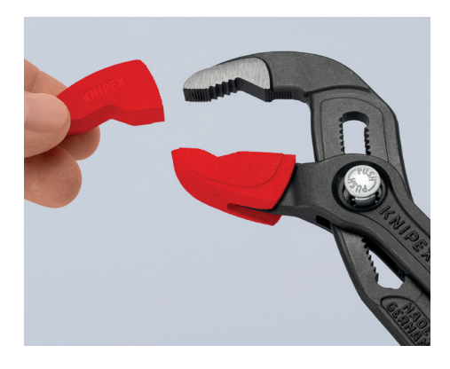
> Easily snaps onto gripping jaws of the 7 1/4", 10" and 12" Cobra® Pliers