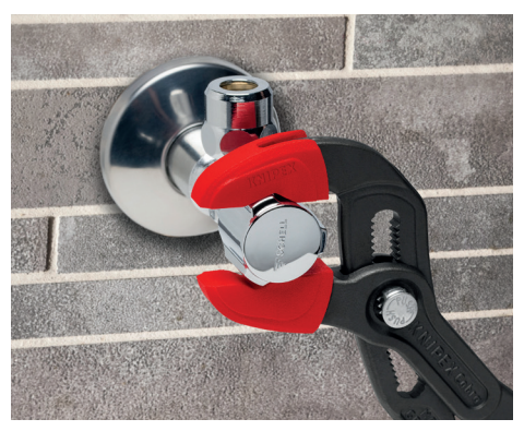
> The protective jaws have a smooth gripping surface and cover all the teeth on the tool