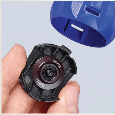
Spare cutting wheel and needle-bearing is stored in the blue handle

steel pipes with a wall thickness up to 5/64" (2 mm) and diameters from 1/4"-3" (6 to 76 mm)