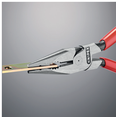
3-point contact for secure gripping