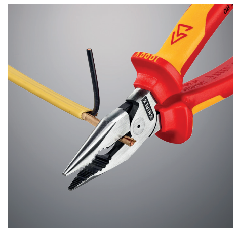
High leverage and induction-hardened cutting edges