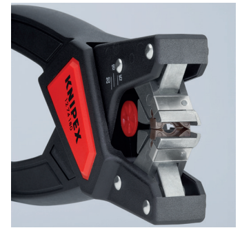
Complex cutter design for precise and damage-free stripping of round cables