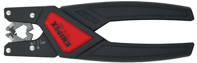
12 74 180 SB