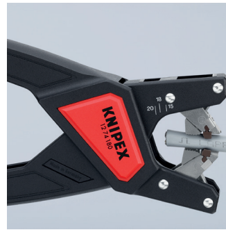
Required stripping length easy to read