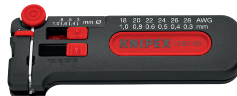
12 80 100 SB