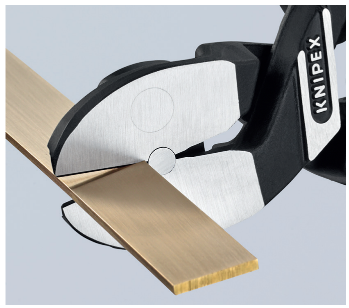
Copper busbars are cut cleanly and flush