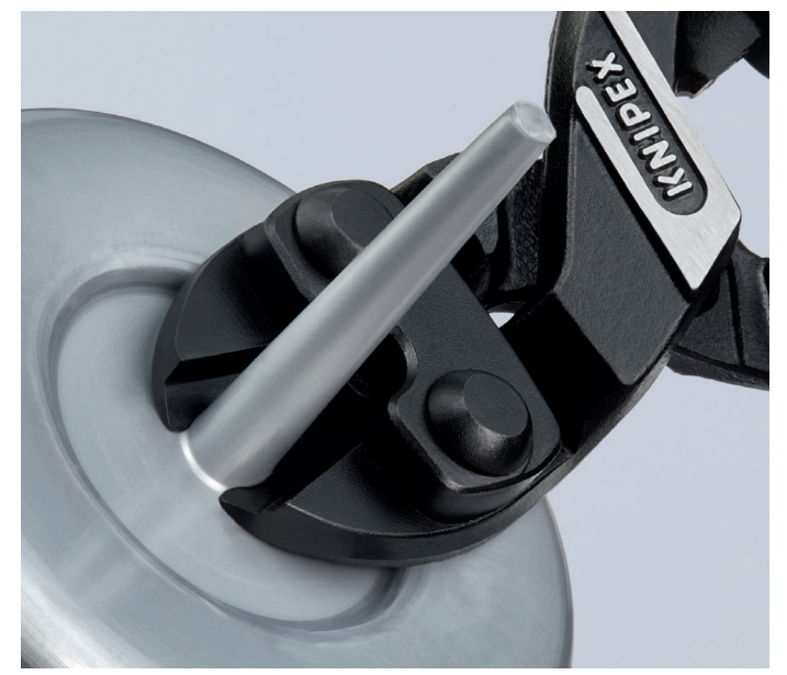
Ideal for the flush cutting of plastic sprues with large diameters