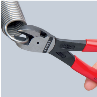
Cutting edges in the center of the cutter head